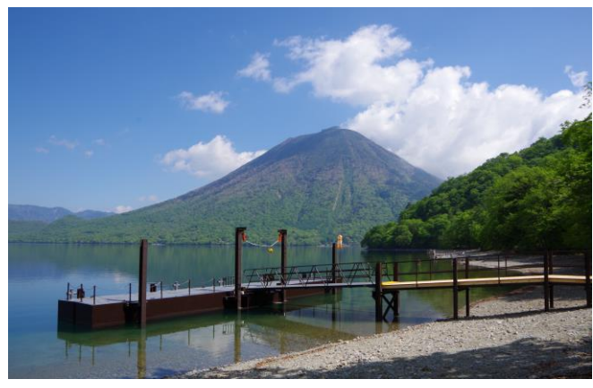
ΔFull view of the new pier Embassy Villa Memorial Parks